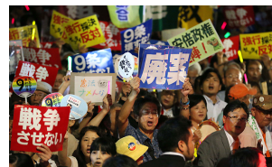
Protest against National Security Law, 15 September 2015

The Diet deliberations on the bill were a sham as Abe and his ministers refused to seriously answer opposition interpellators. On September 17, the bill was forced through an Upper House committee and then passed on September 19 by the full house, where the LDP-Komeito coalition government holds a majority.