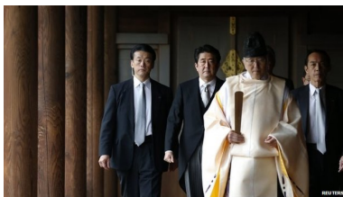
Abe visiting Yasukuni Shrine, 26 December 2013

When it comes to relations with the US, there's no way the US will accept the stance that the Great East Asia War was legitimate. As a result, US-Japan relations were very tense for a while. In October 2013, when Secretary of State John Kerry and Secretary of Defense Chuck Hagel arrived in Japan for negotiations on the US-Japan defense guidelines, their first stop was to make an offering at the Chidorigafuchi National Cemetery, (which houses a memorial to unidentified war dead and is considered a neutral war memorial compared to the politicized Yasukuni Shrine). It was a forceful expression of displeasure. Shortly afterward, PM Abe made a visit to Yasukuni. The US embassy issued a statement of “disappointment” over his decision to do so. Abe's stance creates cracks in the Japan-US relationship.