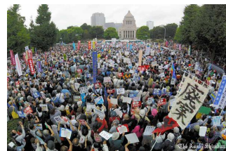
Protest against National Security Law, 30 August 2015

This added momentum to the keen sense of crisis already motivating the public to action, the perception that the security legislation would change Japan into a country that would fight wars. This alarmed young people. In addition to the issue of unconstitutionality, the issue of peace—and whether there would be a military draft—loomed large in their eyes.