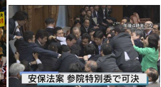
National Security Law bill forcibly passed in Upper House, 17 September 2015

The Abe administration used this victory to advance two major policy positions. The first is to