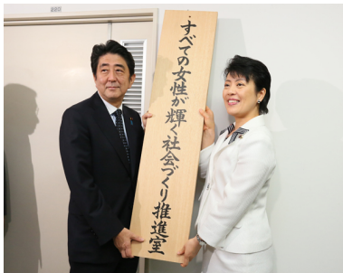
Establishment of Office for the promotion of building a society where all women shine

[Chinese Heart: The Paradox of the Japanese Spirit].” This is unbelievable. This notorious right-wing thinker is appointed to a key position at NHK. The first thing a coup d’état administration does is to occupy the controlling heights, especially asserting control over broadcasting. This is the Abe methodology, grabbing state power in what amounts to a virtual coup d’état.