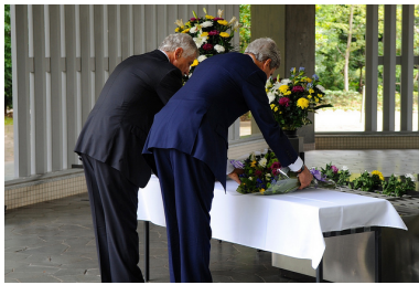
John Kerry and Chuck Hagel at the Chidorigafuchi National Cemetery, 3 October 2013

kind of strategy? He proposes to organize an “arc of liberty and prosperity,” running from Europe through the Middle East, to India, Southeast Asia, and Japan, an alliance of countries with shared values led by Japan, advancing economic development and guaranteeing mutual security. This is clearly a China containment policy. It is virtually impossible to build friendly relations with China on that foundation.