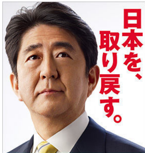
Abe Shinzo: "Retake Japan"