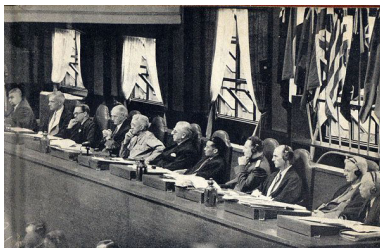
International Military Tribunal for the Far East, 1946

Commission (which would have the authority to decide policies for the occupation of Japan) could be set up and issue a directive to prosecute the emperor. The draft constitution was comparatively democratic, with content that would not raise objections among the public in either the Soviet Union or the US. That constitution was adopted, so the postwar emperor system is often referred to as an American-made system.