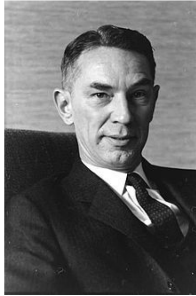
Edwin Reischauer in 1961

The prewar and wartime emperor was not at all an ornament, but rather was the generalissimo who rode out from the palace in uniform on a white horse. A photograph of this scene was displayed on the walls of many homes. This man led his country in successive wars, his army was responsible for the deaths of tens of millions of people in Asia, and millions of his own soldiers and Japanese civilians died. Many of those soldiers starved to death. And he lost the war. Despite being the commander in chief of the war, after his government surrendered to the allies, he retained the title of emperor and continued to live in the Imperial Palace.